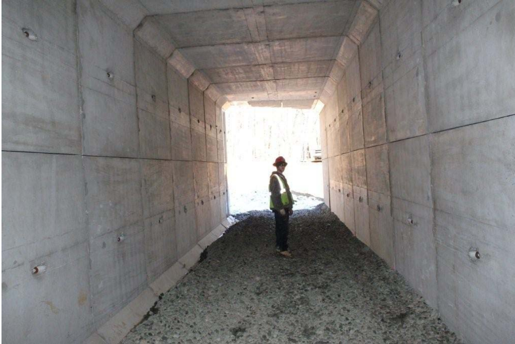
Tunnel with Steven Shelby of Charles DeWeese Construction Inc. inside. Steven Shelby stands in the 14-ft. tunnel that allows the large deer population in the area to pass safely under the roadway.

has experienced a substantial increase in the number of people stationed or employed there. The increase in the traffic in this heavily-traveled area required infrastructure upgrades at the base. A new culvert replaced two aging runs of 36-inch reinforced-concrete pipe. The structure was placed in two phases: one was completed in September 2010, and the second in January 2011. This allowed for the excavation and backfilling that needed to occur in order to move the road.